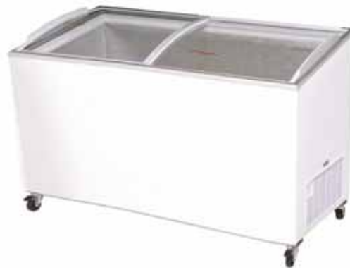
Chest Freezer Angle Top Curved Glass - 6ft CF0600ATCG