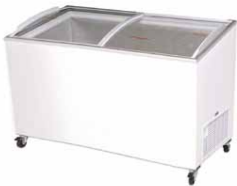
Chest Freezer Angle Top Curved Glass - 5ft CF0500ATCG