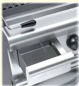
Useful fat collection tray

Modern technology combined with the strength of AISI 304 18/10 stainless steel, with a Scotch Brite finish. Sober and elegant lines are the result of aesthetic research focusing on modern criteria in terms of ergonomics and functionality. This is the 'Settecento Baron' series: a professional kitchen, just 70 centimetres deep, that can be manufactured according to your exact requirements, without making any sacrifices and without any limits in terms of its composition. All of this plus the CE mark. Equipment designed and built to guarantee total safety as well as perfect hygiene with the utmost in energy efficiency.