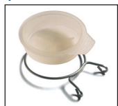
Proximity condenser air filter