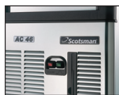
Front ON-OFF Switch