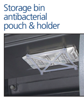
Storage bin antibacterial pouch & holder