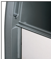
Noiseless bin door