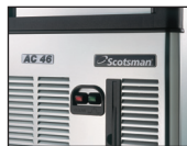
Front ON-OFF Switch