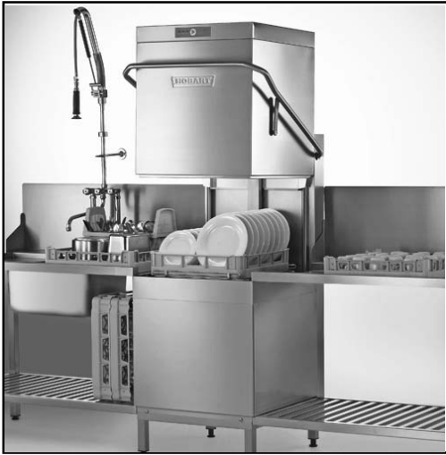
Accessories not included