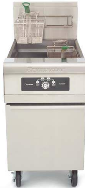
Shown with optional castors

This 158.3mj model is specifically designed for high production of chicken, fish and other breaded products. The exclusive 1° action thermostat (two-year limited warranty) anticipates rapid rate of temperature rise, reducing temperature overshoot, extending shortening life and producing a more uniformly-cooked product. Centerline thermostat mounting permits quick sensing of cold food placed in either basket.