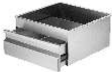
19 - Drawers (fit to the underside of work benches)

sizing Benching is available in 600 deep & 700 deep ranges. All benches have a 900mm working height 600 series 600mm deep with 100mm high square profile splashback 700 series 700mm deep with 150mm high beveled splashback tops 1.2mm thick, no.4 finish backing 3.0mm zinc aluminium steel to bench tops frames/legs 38mm diameter round stainless steel tube satin polished 1.2mm thick undershelves 1.0mm thick, no.4 finish with 'top hat' reinforcement bowls fully welded and polished 450 x 450 x 300mm deep bowls in all benches 600 x 450 x 300mm deep bowls in 06-2400 only 19 - Drawers (fit to the underside of work benches)