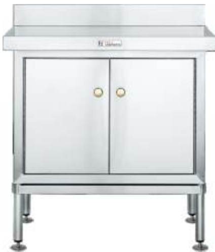
work bench with splashback and door panel kit example shown