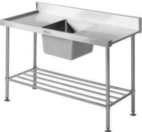
dishwash inlet bench