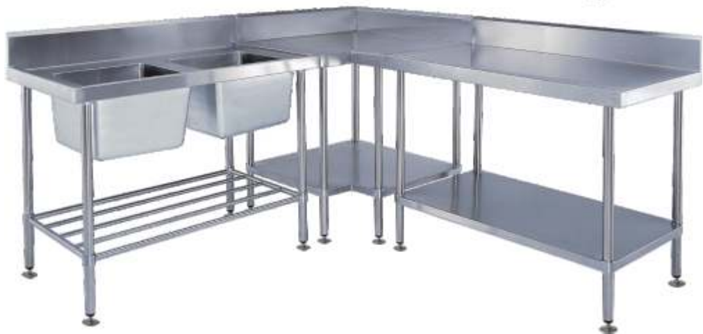
700 series Our range of products are available in 700mm depth. Larger 150mm upstand with beveled edge.