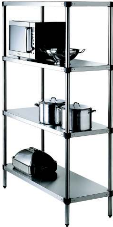
various sizes available example shown W900 x D525 x H1800 *utensil not included