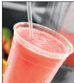
Strawberry Orange Smoothie