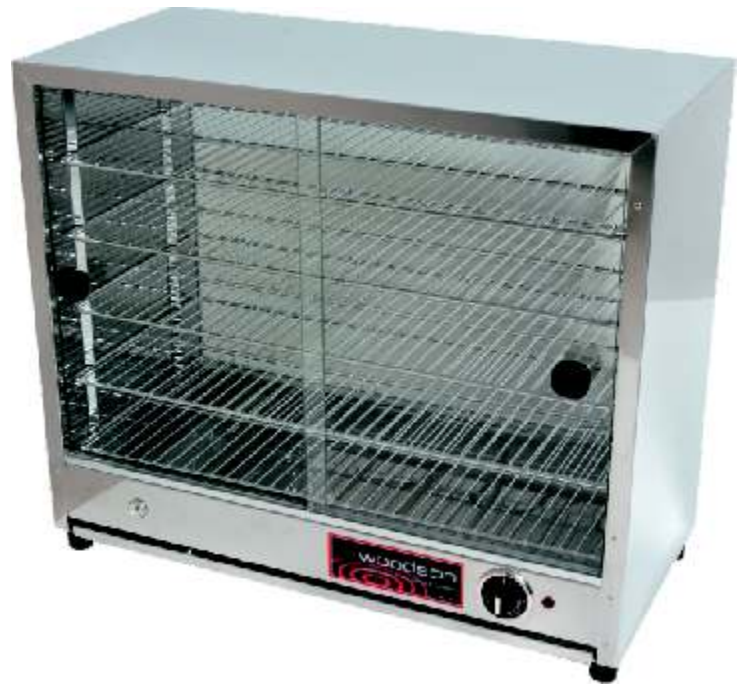
Model shown WPIA100