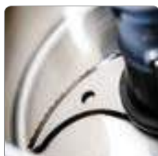
Serrated knife blades