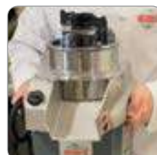
Easy to move