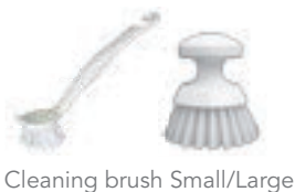
Cleaning brush Small/Large