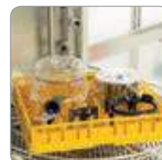
Machine washable parts