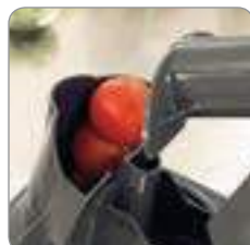
Stacking of tomatoes