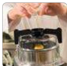
Add during process